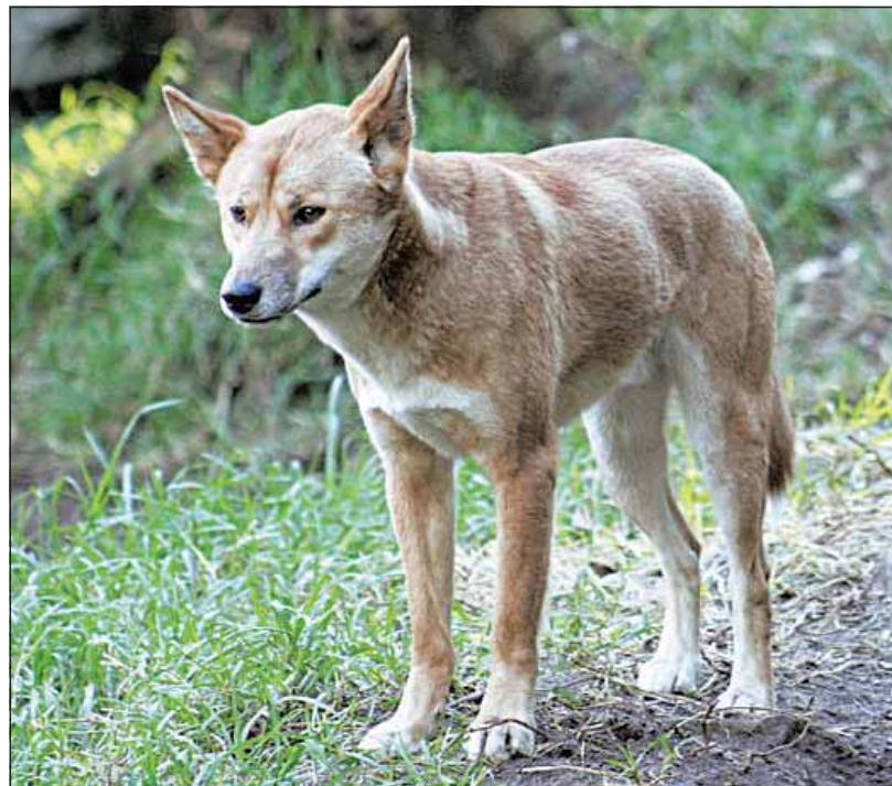
Victoria's dingo population is to be assessed. -Kim Navarre

To allow the control of dingoes where they threaten livestock, an order of council was made under the Wildlife Act , declaring the dingo as unprotect within a three kilometre buffer zone on public land in Eastern Victoria, and on most private land across the state.