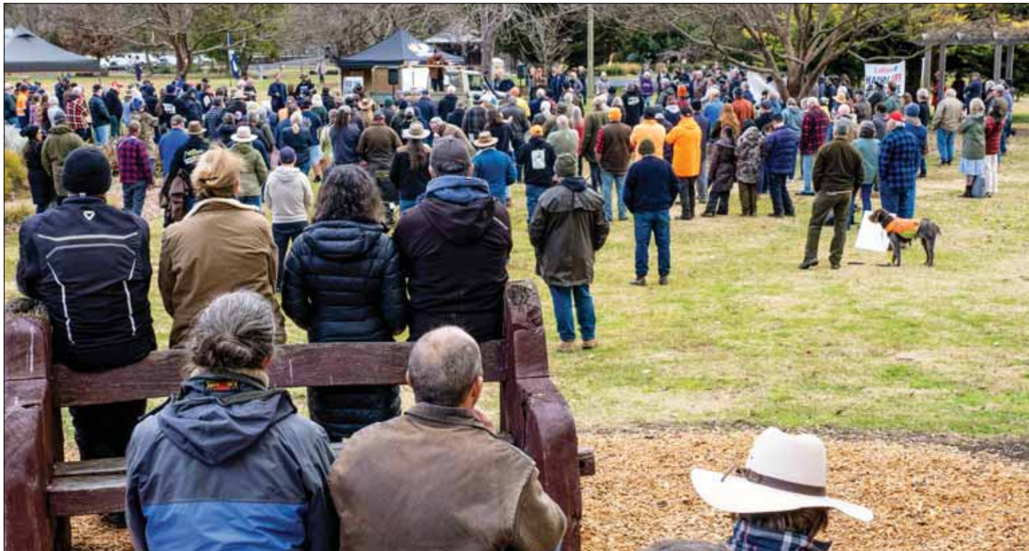
There was a large turnout in Mansfield for the Forests for the People Rally on Saturday, July 13. The protesters included some from Murrindindi Shire. It relates to the proposed national park. A report from the Victorian Environmental Assessment Council (VEAC) is due by the end of July.