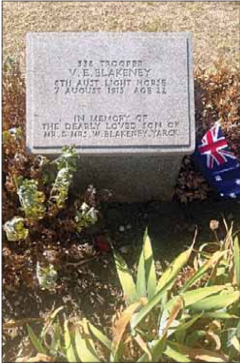
Ari Burnu Cemetery where V E Blakeney lies. -S