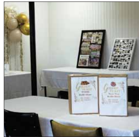
The Thornton Eildon club room was done up for Golden Ticket Day. -BD