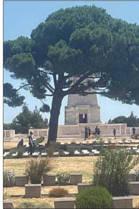
Lone Pine Cemetery where S Arbutnot and V Raymond are identified on panels. -S