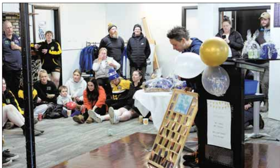
Many gathered in the club rooms for Golden Ticket Day. -BD