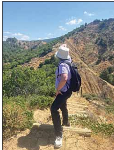
'Rhododendron Ridge' connecting the beach near Anzac Cove and Ari Burnu cemetery with Chunuk Bair, site of fierce fighting between New Zealanders and the Ottomans. -S