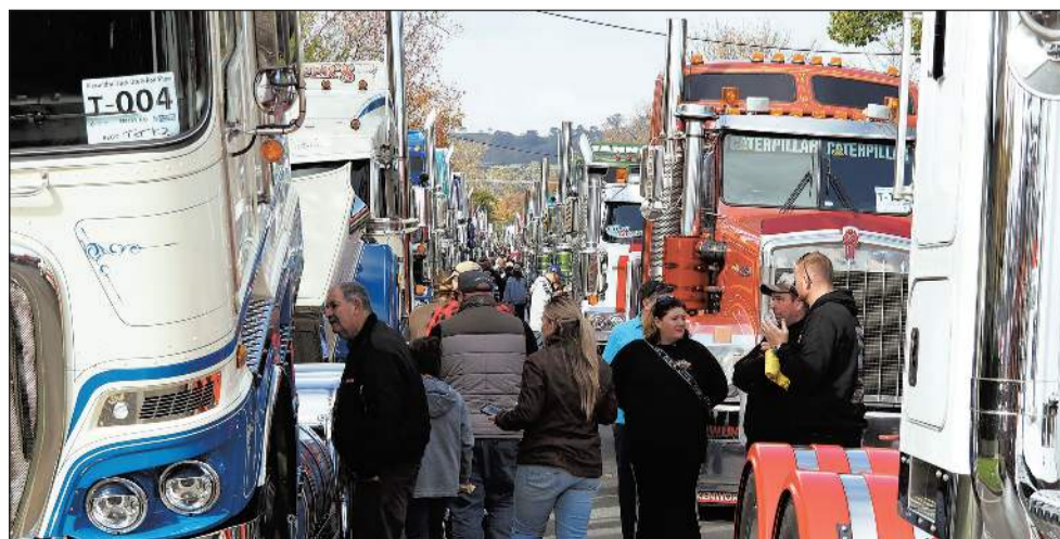
The trucks were lined up on Grant Street right through to Thom Street. -AR