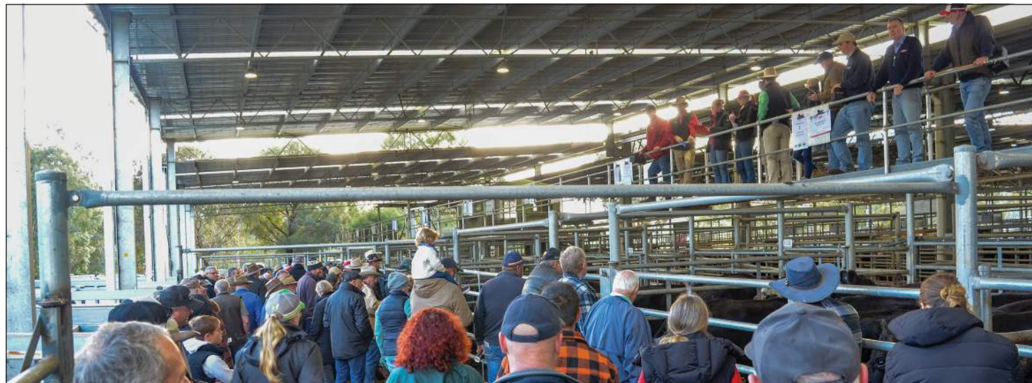
Despite several cattle sales through May, the June store sale was still relatively well attended. -BD