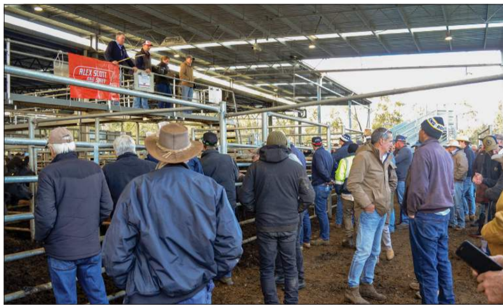
Livestock agents at the sale included Elders, Nutrien, VLP and Alex Scott and Staff.