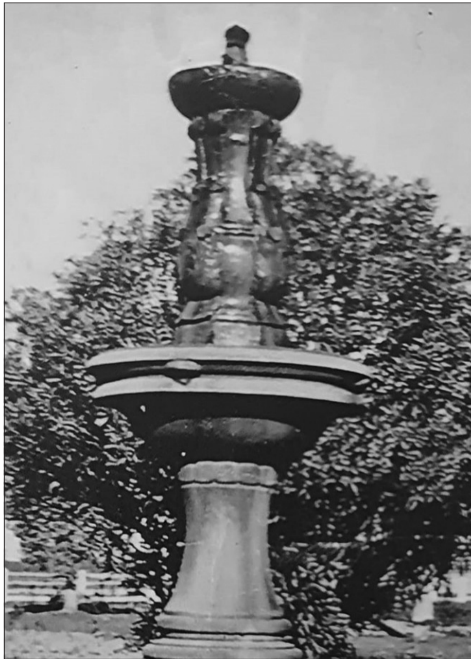
A pre-World War II photo of the Yea Ideal Town fountain showing the missing finial from the top. -S

More next week on the efforts residents made and the celebrations which followed.