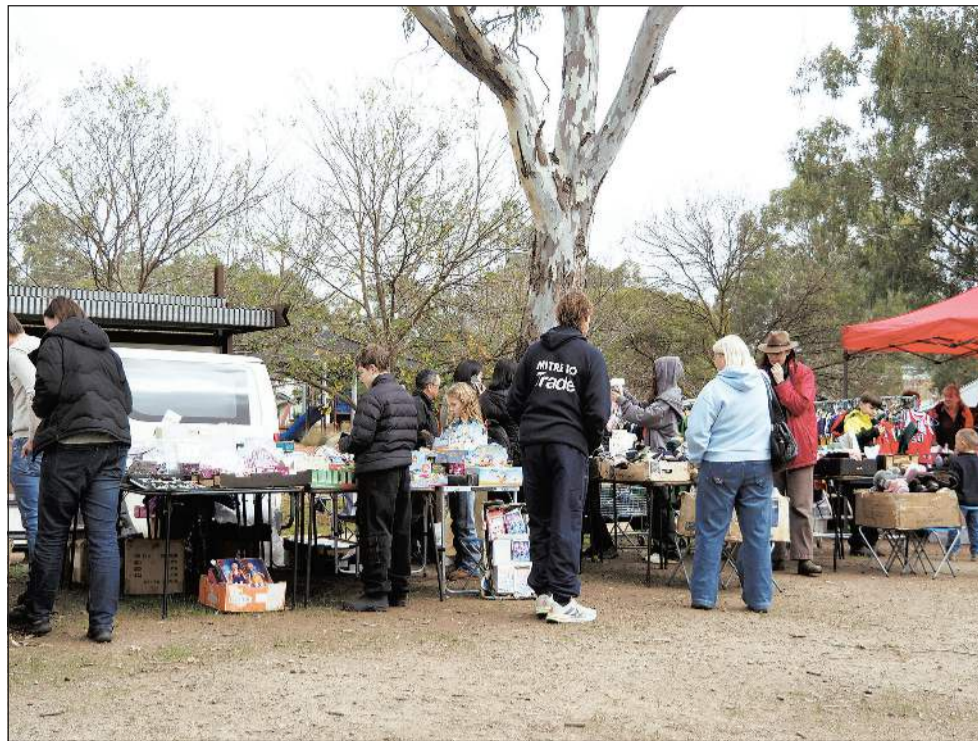
Keen shoppers at the Yea Railway Market on Saturday, June 6.