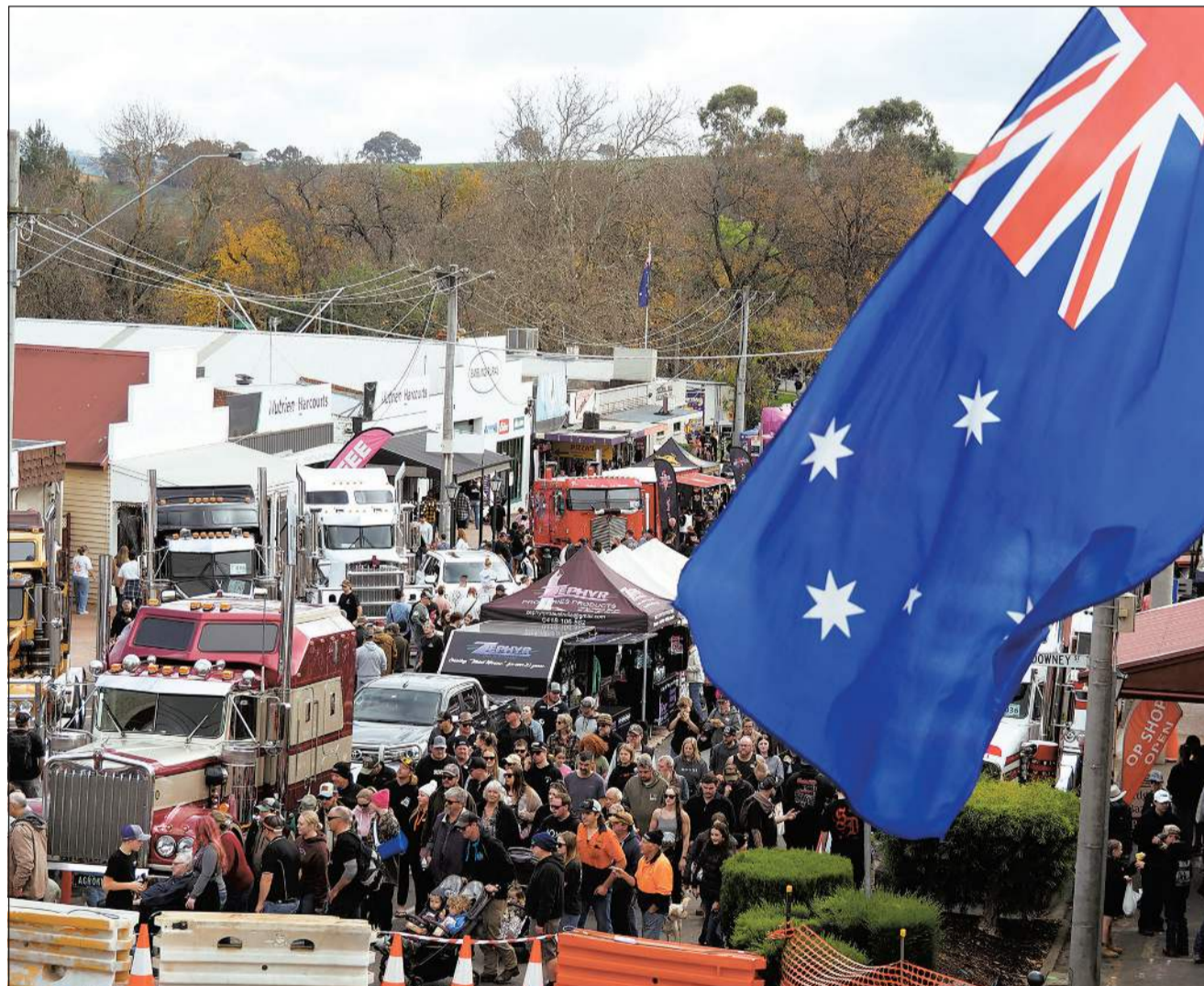
The Australian flag flying above the crowd from the Corner Hotel. -AR