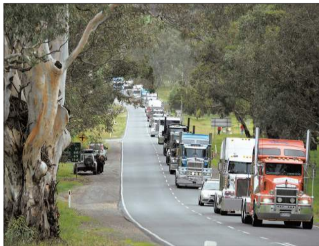
The truck run from Yarck to Alexandra on Saturday, June 6.