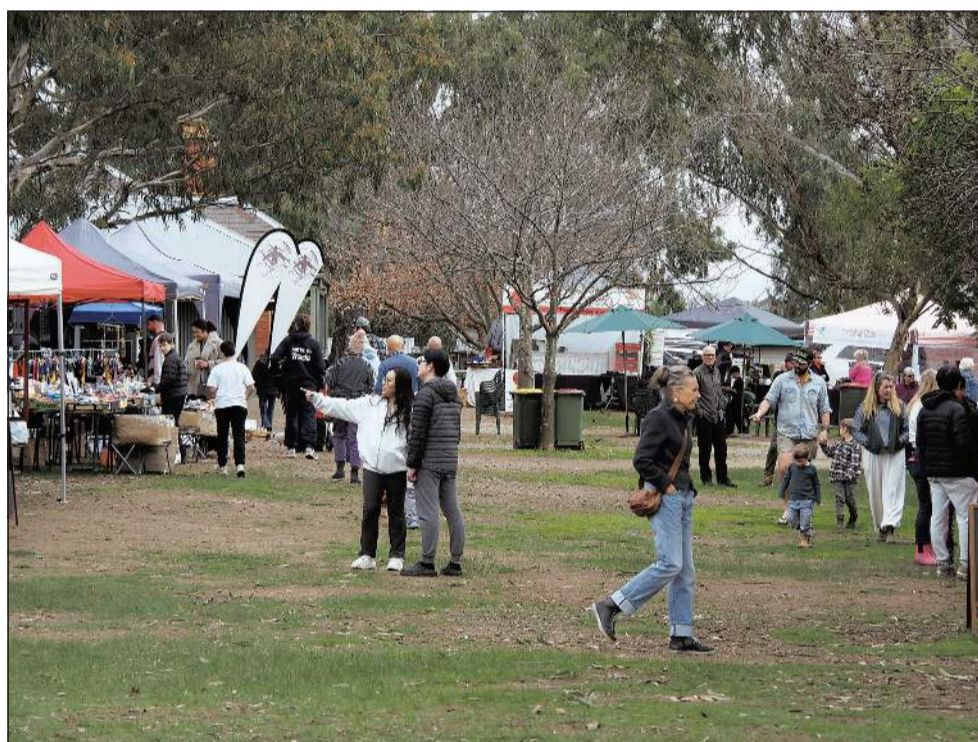
People braved the winter chill to browse and buy. -AR