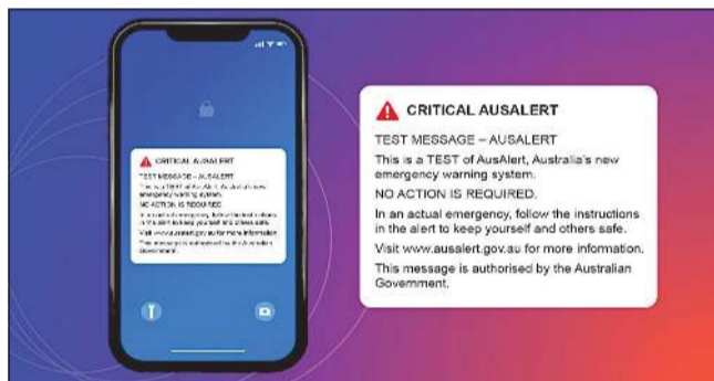
The test message will be similar to the text in this image. -S

If the decoding of animal languages continue, and it becomes more widely available to the public, imagine what you might hear as you walk through our beautiful forests. Just don't tread on an ant.