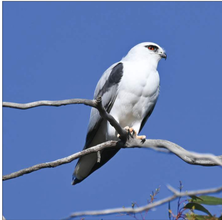
A black-shouldered kite.