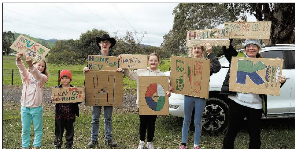
Children welcoming the trucks on the truck run on Saturday, June 6, encouraging the drivers to honk as they passed.