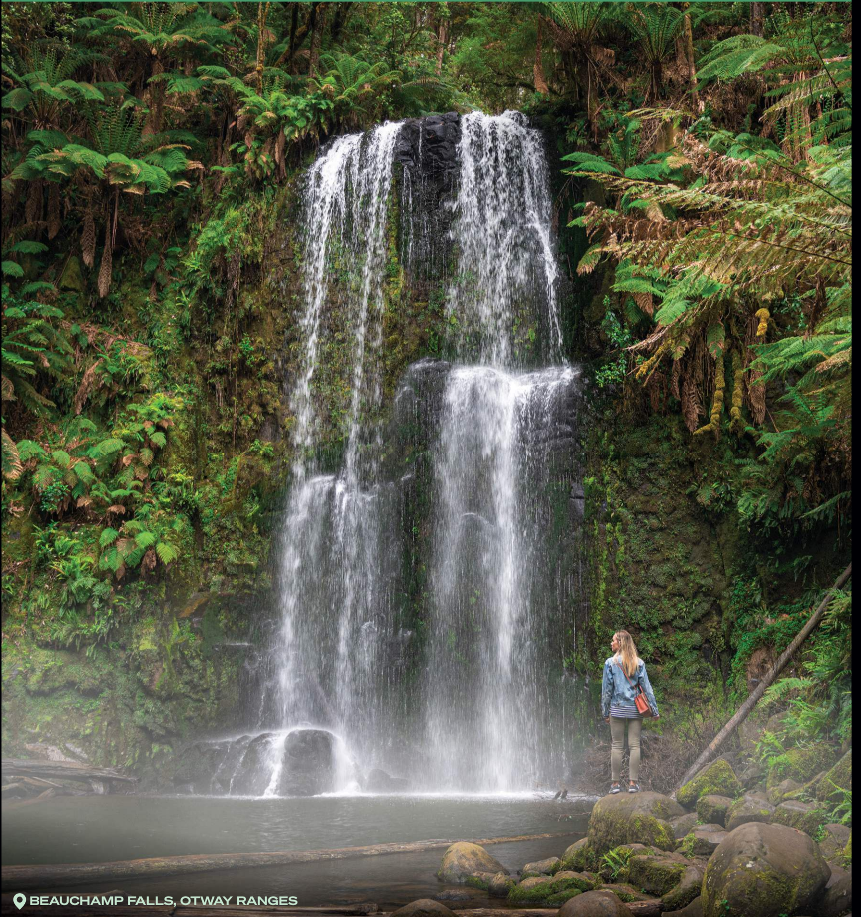
📍 BEAUCHAMP FALLS, OTWAY RANGES

Have you heard about the misty bit of winter in Victoria?