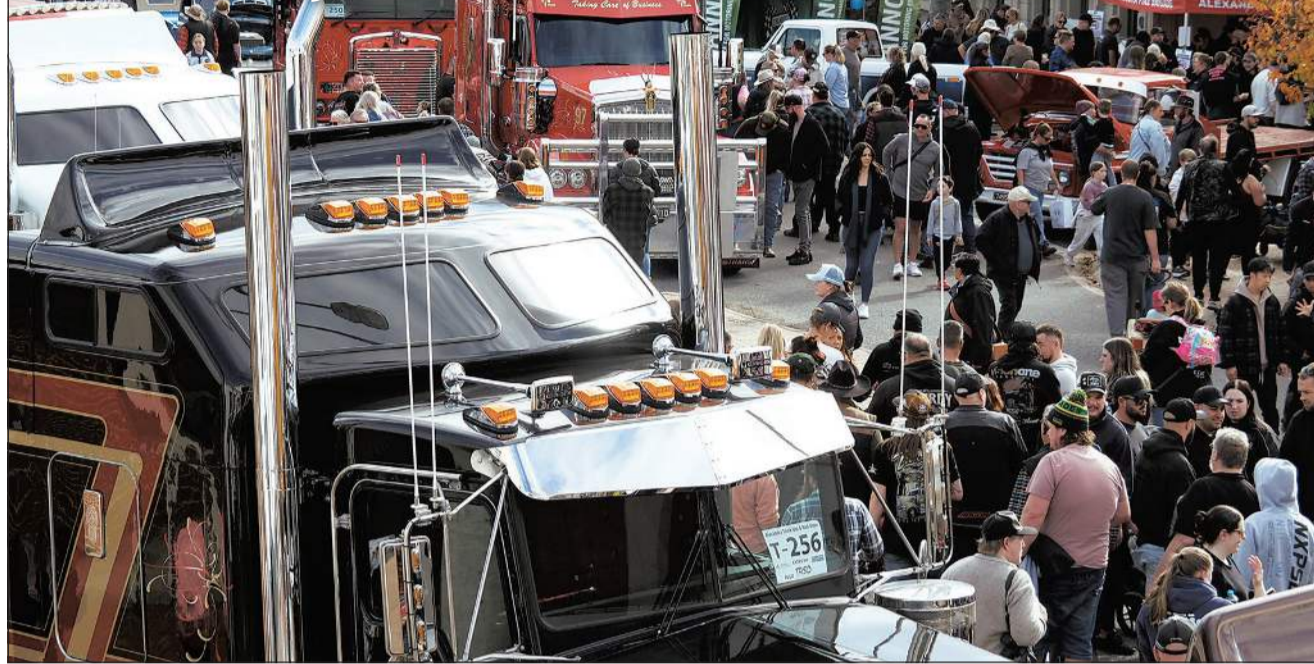
There were an estimated 15,000 people at the event. -AR