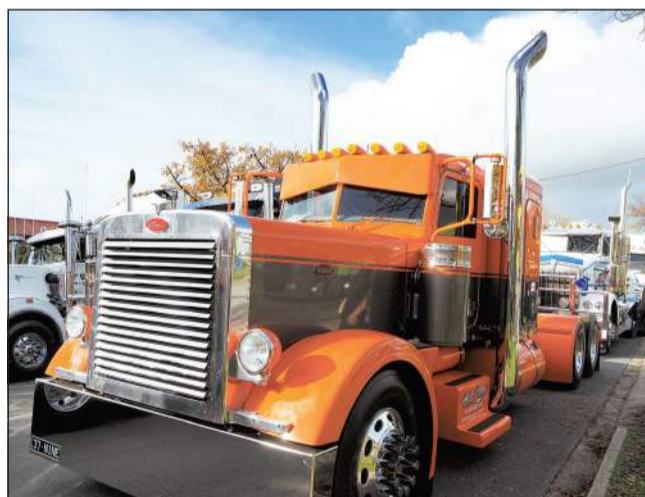
A truck reminiscent of the truck from Spielberg's first film, Duel. -AR