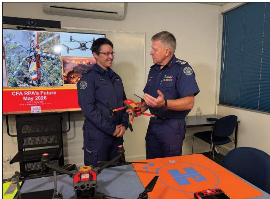
One of the new CFA drones. -S

"The varying capabilities such as still images, 4K video, HD video, optical zoom and thermal imaging provide invaluable insights to our incident controllers and firefighters."