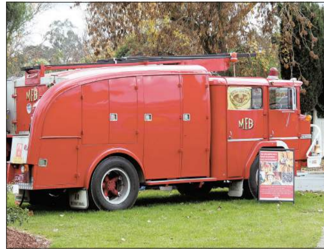
One of the old fire trucks forming part of the CFA display. -AR