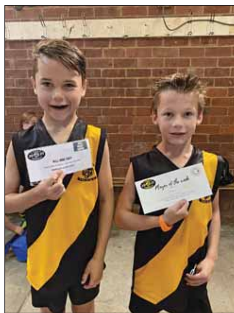
Under 9s Round 3 Awards. -S