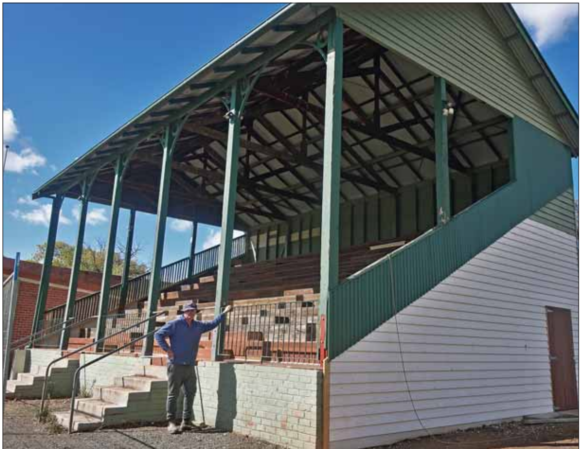
The grandstand at the Yea Showgrounds. -S

To view the full results of last year's count, visit council's website at murrindindi.vic.gov.au and search 'Bird Count Findings'. To be part of the Aussie Backyard Bird Count this year from October 18 to 24, visit aussiebirdcount.org.au for further information or contact council on 5772 0333.