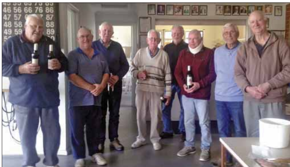
Winners of the day receiving their bottles of wine. -S