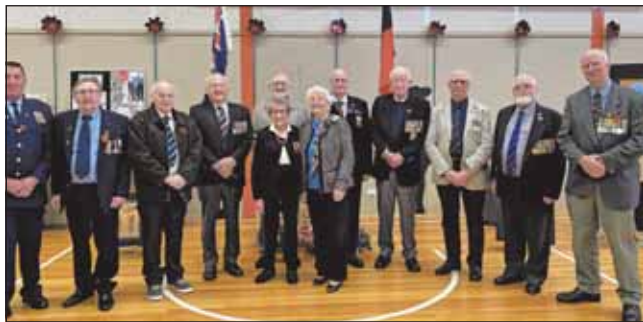
Guests from the RSL.