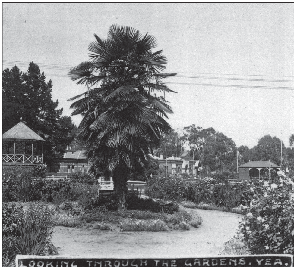
Yea Gardens and Bandstand. -S

The removal of the pines also gave returning soldiers some employment and the decision was made to plant deciduous trees so the sun could penetrate the main street in the winter and give the best shade during the hot summer months.