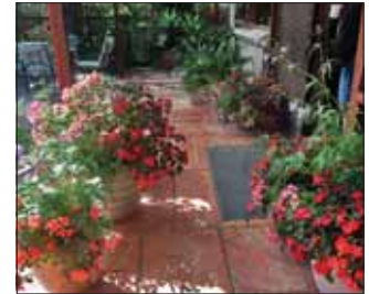
Yea Open Gardens will treat its visitors to a number of stunning locations, thriving with flowers, trees and many more plants. -S

'Burra Park' was established from a bare paddock in 2005 and was purposely designed in circles and semi-circles. Some necessary renovations and new plantings were carried out last year and two large sculptures are new additions.