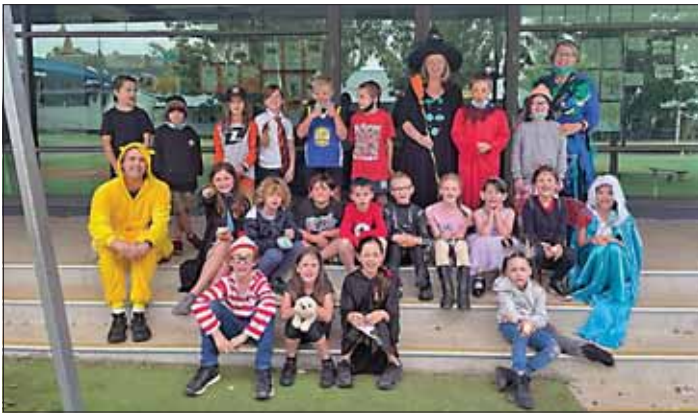
Grades two and three in fancy dress. -S