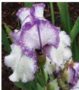
T&C: Two photos per household per category

Send your photos to 1sales@alexandranewspapers.com.au or drop them in to either the Alexandra Standard office or the Yea Chronicle office. GOOD LUCK