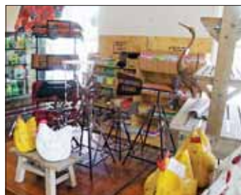
The nursery stocks everything you could need for your garden. -OT