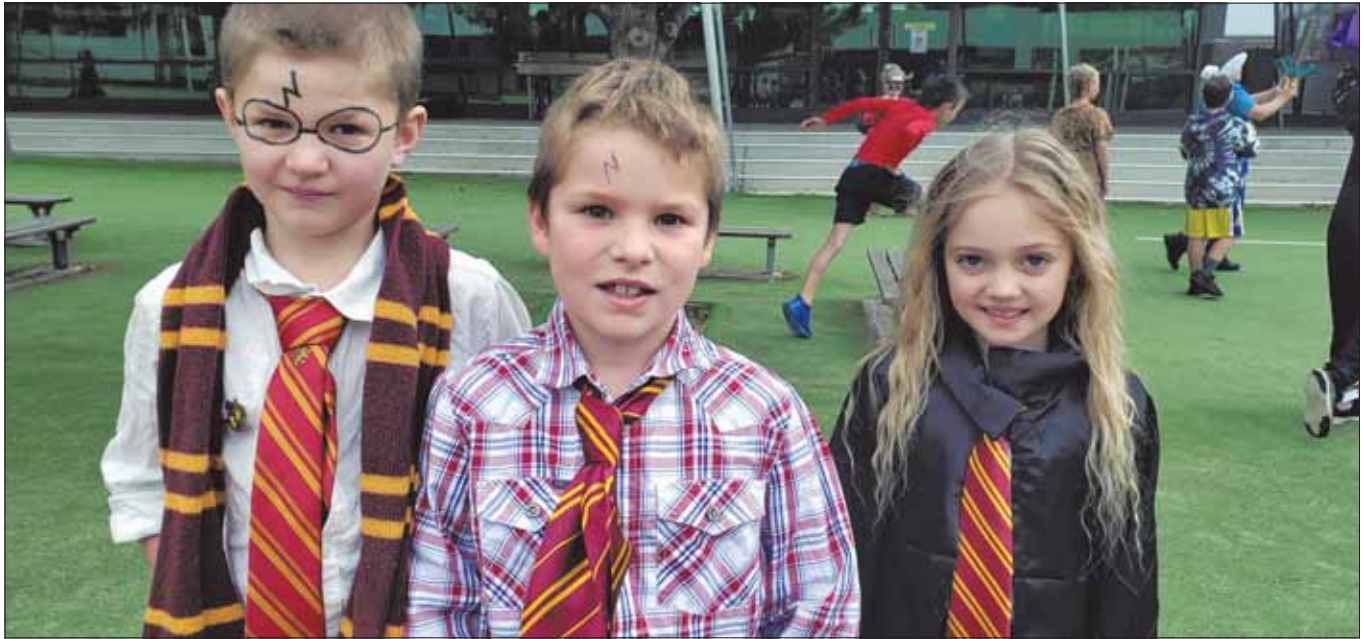
Students from Yea Primary School dressed as characters from Harry Potter for their in-house mini ELF Day. More images on page 3. -S