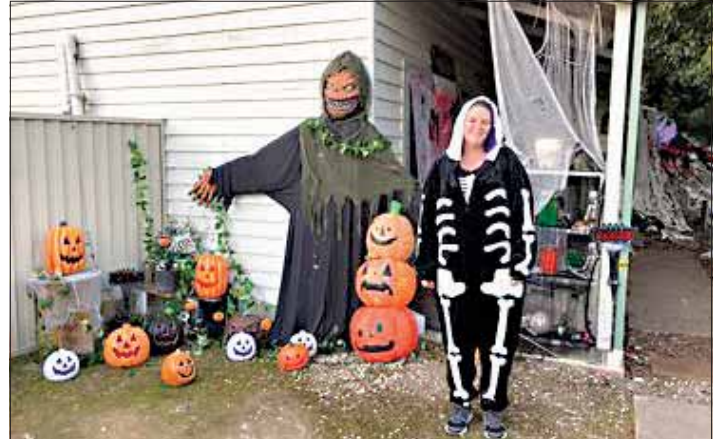
Storm handed out over 200 bags of lollies to the children. -S