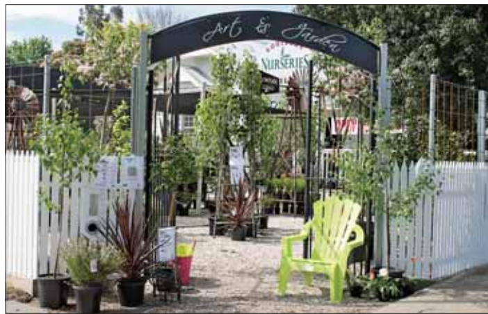
The entry to the nursery.

Goulburn Valley Nurseries is open Wednesday to Friday from 9.30am to 4pm and on Saturday and Sunday from 9.30am to 3pm.