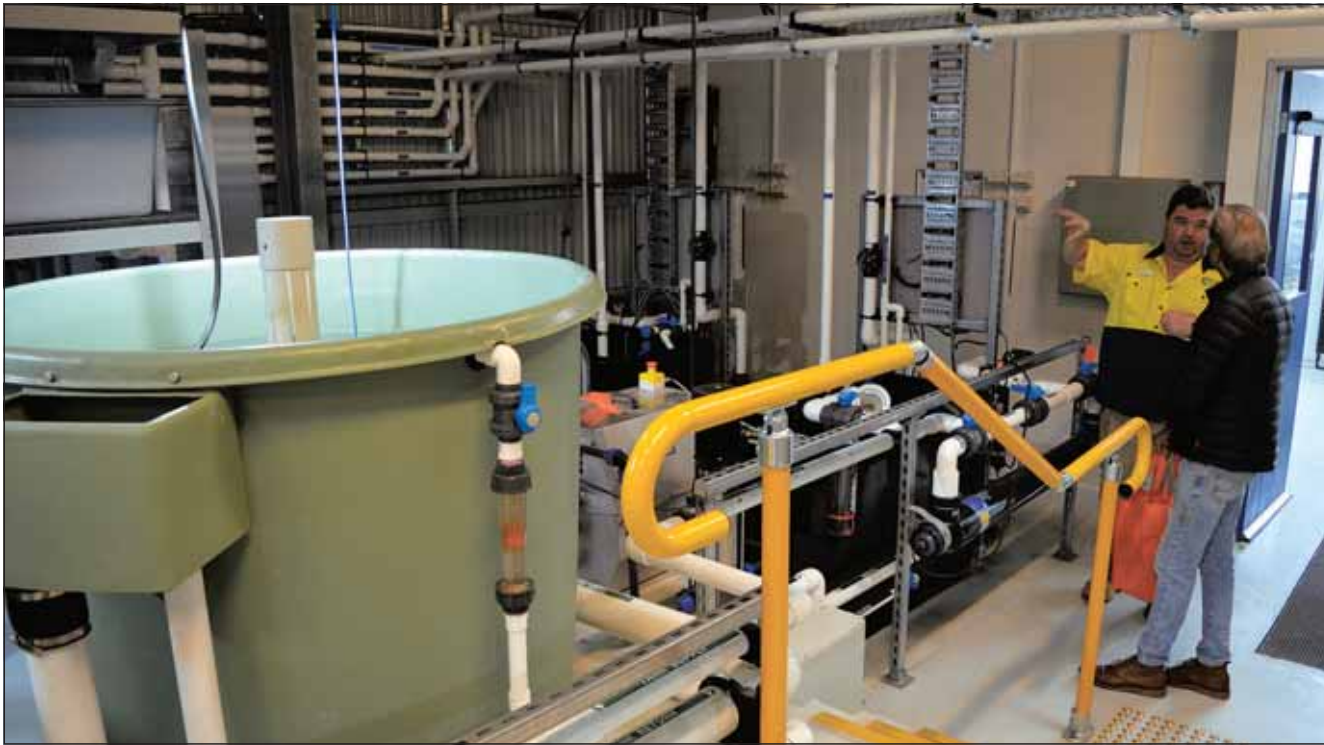
People have an opportunity to wander around Snobs Creek Hatchery and talk to staff at the annual open day.