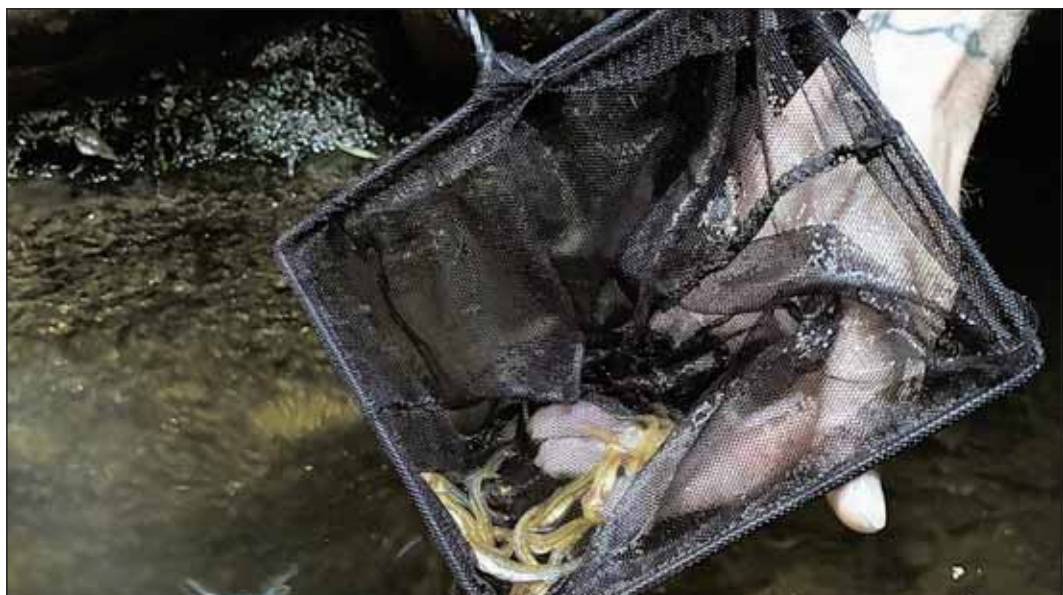
West Gippsland galaxias. -S

For information about the 10inTen plan, visit vfa.vic.gov.au/10inten