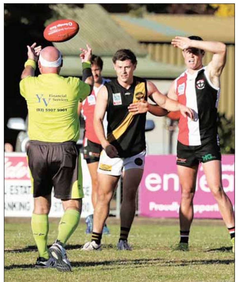
Ball up in the Yea versus Alexandra football game at Rebel Park.