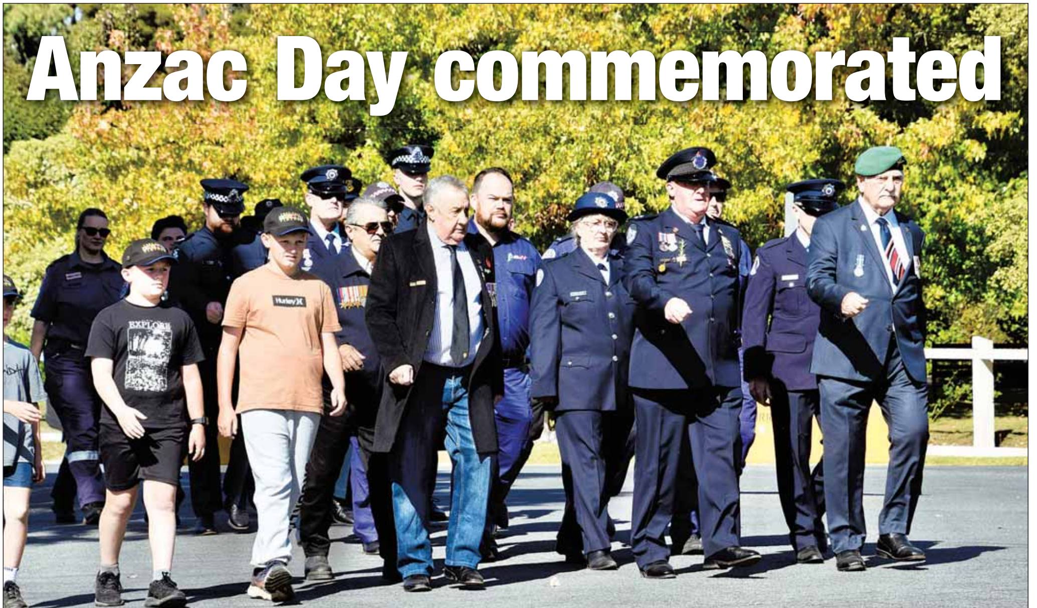
The march to the Yea Cenotaph on Anzac Day. More images on pages 6 and 17.