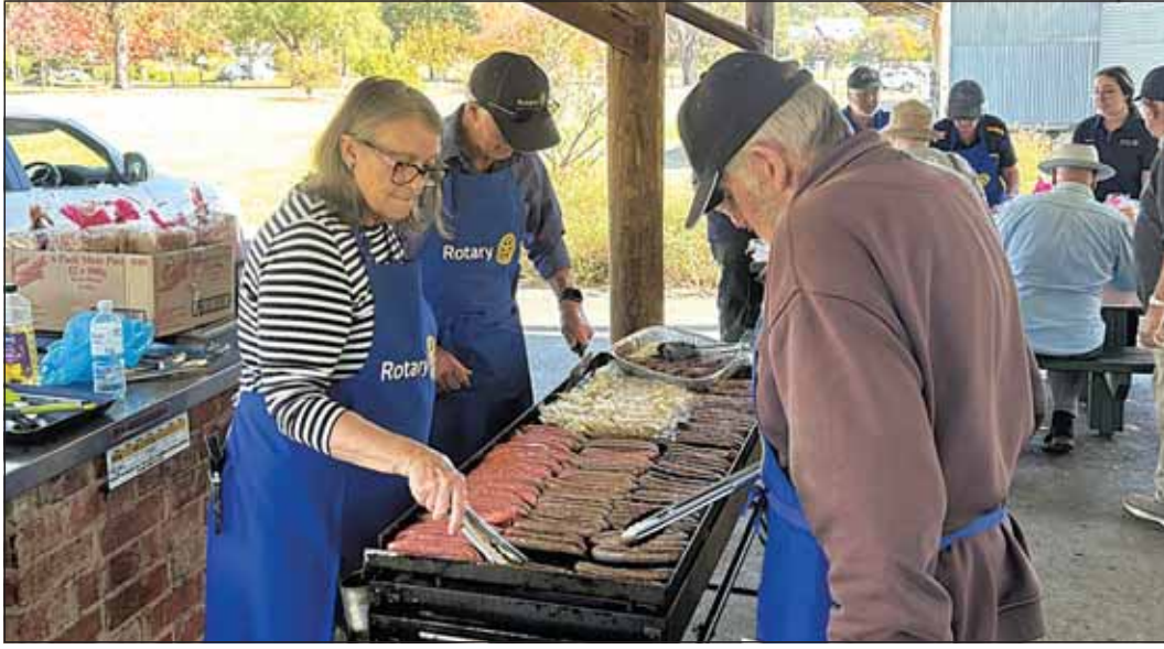
Rotary provided a free barbecue after the Anzac Day service at Railway Park. They served just over 200 sausages. The crowd was much bigger than that but not everyone went for the sausages. They also had a donation box and close to $150 was donated that the Rotary Club of Yea will pass on to the RSL. -S