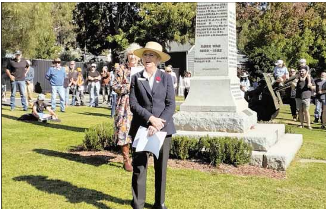
Member for Indi Helen Haines speaking to the crowd.