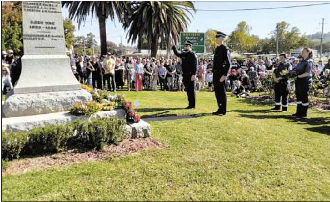
Yea police salute. -S