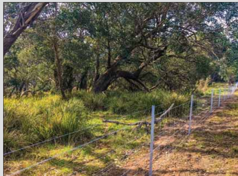
Fencing along Seven Creeks to manage and protect waterways.

The January 2026 Fire Recovery Program is jointly funded by the Commonwealth and Victorian governments through the Disaster Recovery Funding Arrangements.