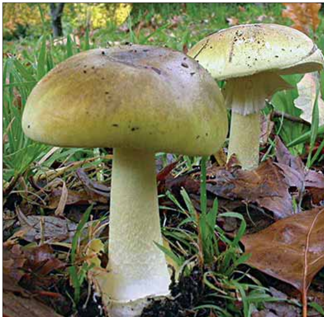
Death cap mushrooms. -Tom May, Royal Botanic Gardens

Victorians are strongly advised to only eat mushrooms purchased from supermarkets, greengrocers or other reputable retailers.