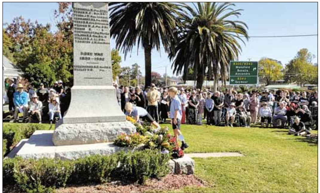
Students from Sacred Heart Primary School laying their wreath. -S