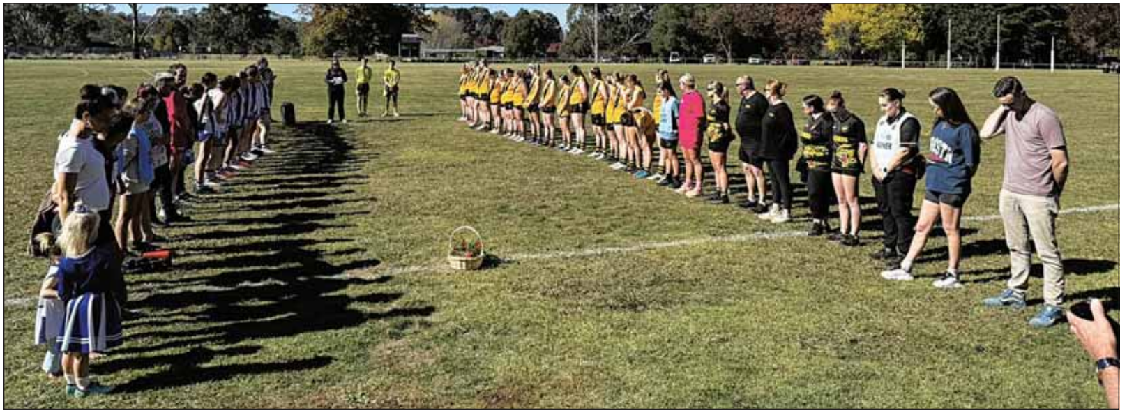
The Yea and Thornton-Eildon women's teams commemorating Anzac Day before play. -S