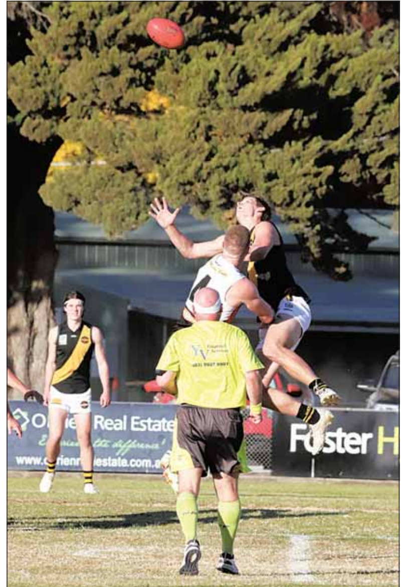
Going for a spectacular mark.