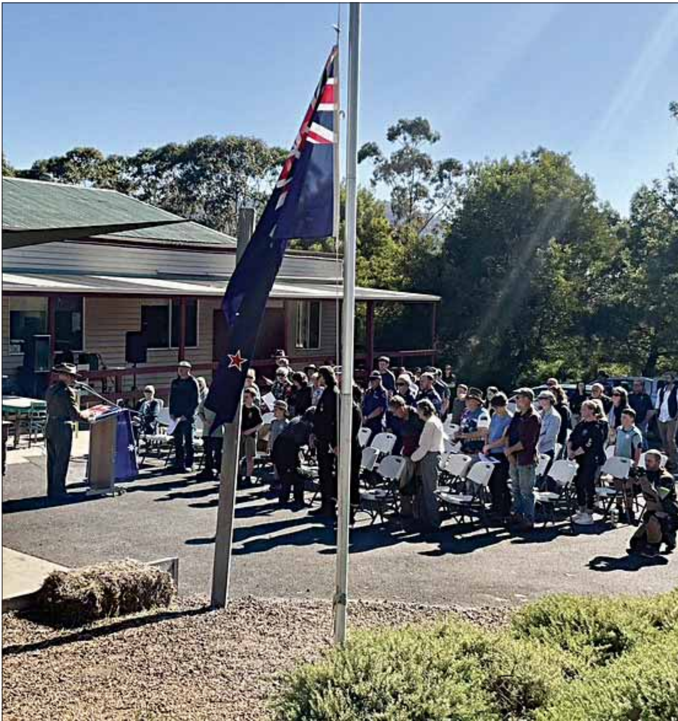
There was a strong attendance at Anzac Day 2026 in Flowerdale. -S