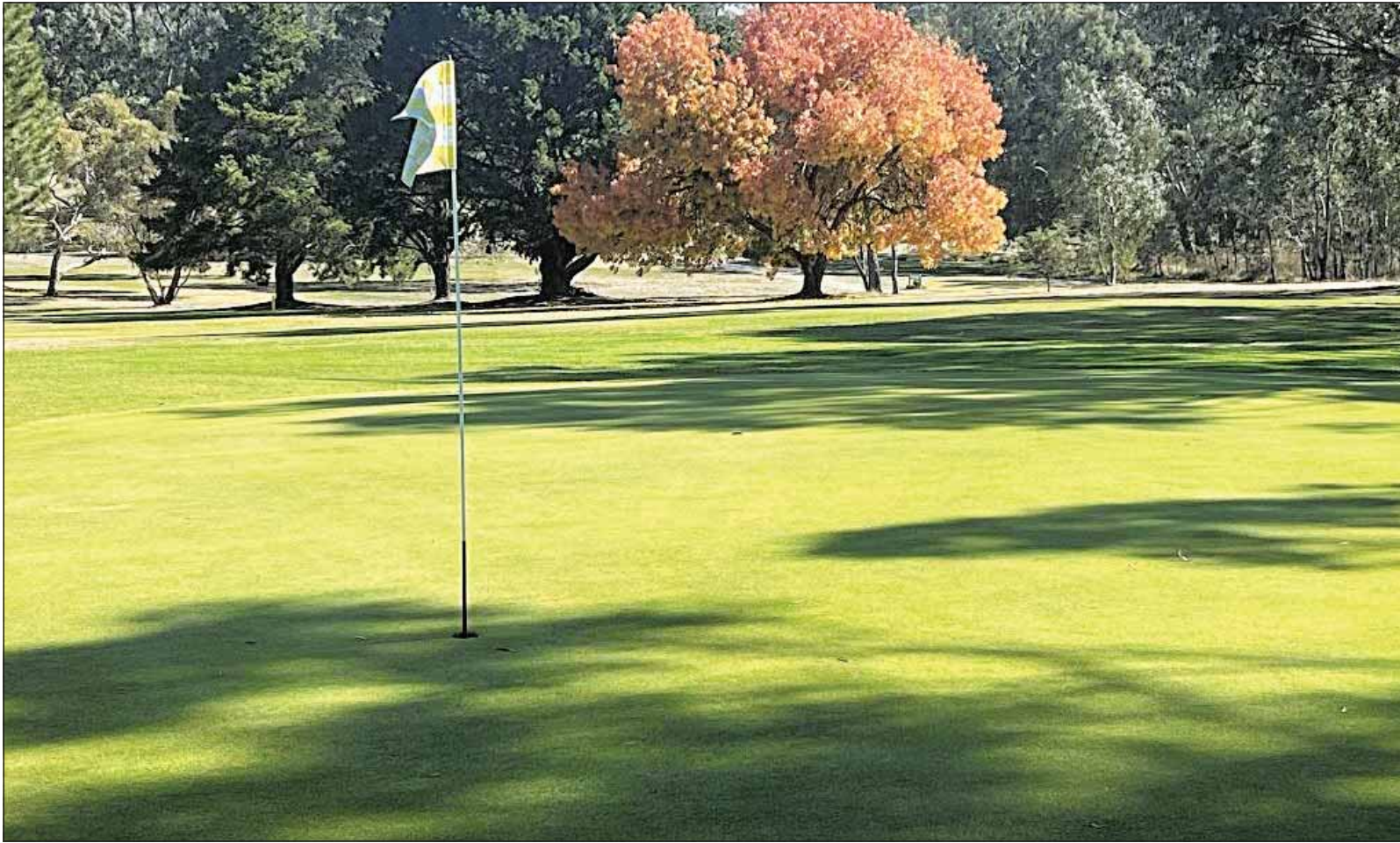
The Yea golf course in ideal autumn conditions. -S