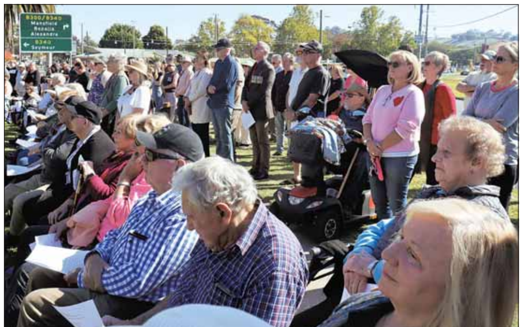
Part of the crowd in Yea on Anzac Day.