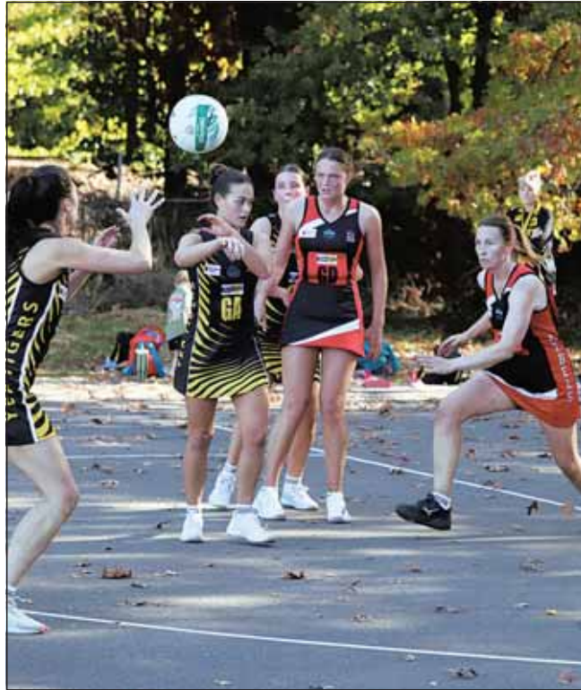
Autumn contest between Yea and Alexandra netballers.