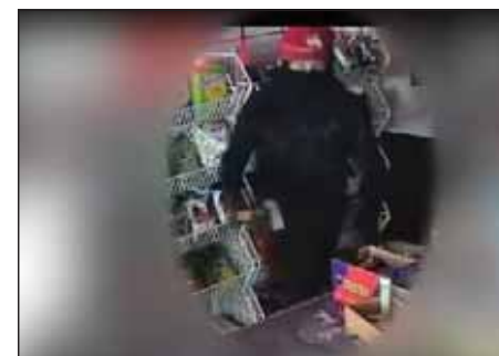
Police are keen to speak to the man in this image regarding the Merton incident.

BENALLA Crime Investigation detectives are seeking assistance from the public following a burglary at a Merton service station on April 15. A male wearing a red bucket hat, all black clothing, gloves, and white shoes, gained entry to the Maroondah Highway premises about 2.50am. He stole cash, cigarettes and a mobile phone. The offender fled in a newer model silver Toyota Rav 4 (possibly a XSE variant) with black rims and roof. Investigators believe a second person was in the vehicle, in the front passenger seat. This follows on from a similar incident in Eildon about 2.30am on Saturday, March 14. An offender gained entry to a service station on Centre Avenue, stealing a safe containing cash. Investigators have released images of a person wearing a grey 'NXP' hoodie, black pants and white sneakers, who they believe may be able to assist the investigation. Police have also released an image of a white dual cab Toyota utility that was in the vicinity at the time of the Eildon incident. Anyone who can help identify an offender or one of the vehicles mentioned is urged to contact Crimestoppers.