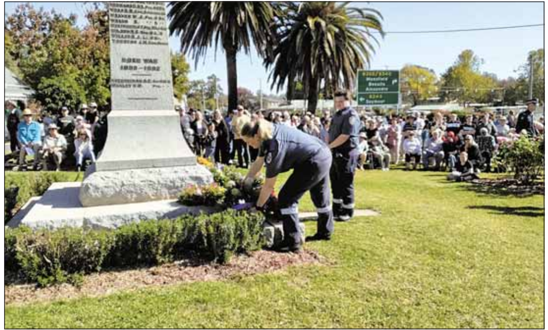
Ambulance Victoria members placing their wreath. -S