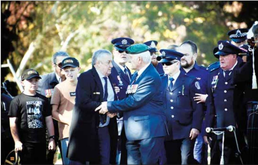
A show of support at the Yea Anzac Day service. -S