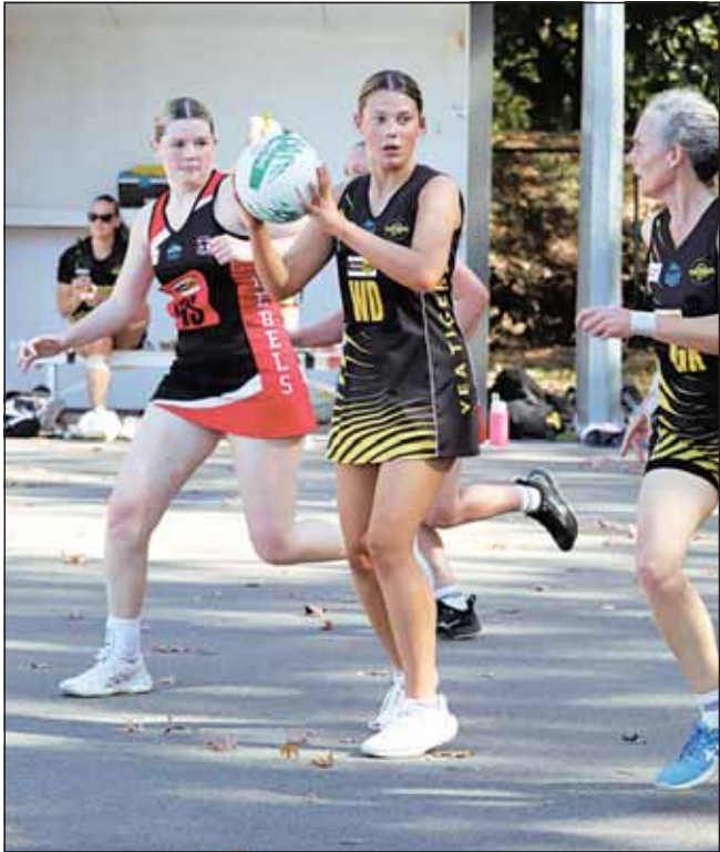
Yea looking to move the ball.