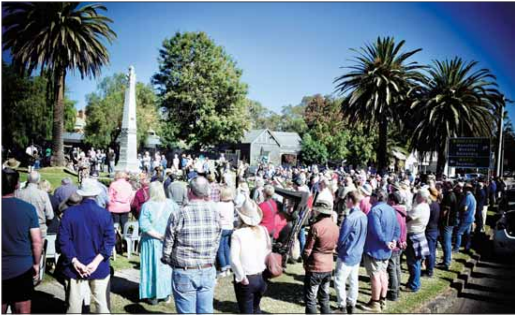
There was a large turnout in Yea for Anzac Day. -S