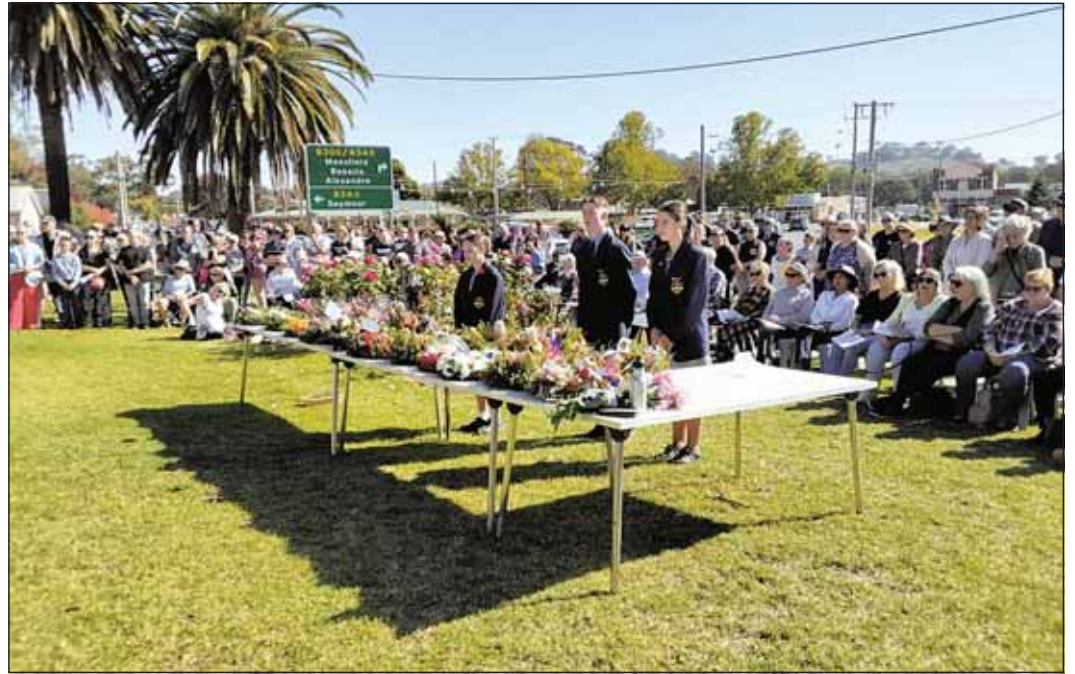
Yea High School students with the wreaths. -S