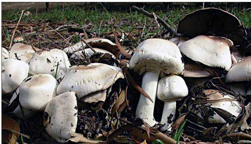
Yellow staining mushrooms. -Tom May, Royal Botanic Gardens